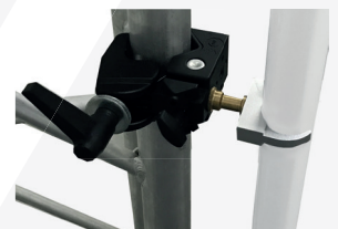
Holder for hanging / safety