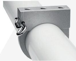
Holder on Tube

Essential grip for mounting Astera tubes to walls, truss and other structures.