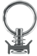
PowerStation Hanger FP5-PSH