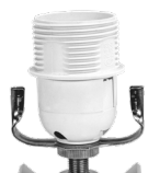
Lamp Socket FP5-E27S